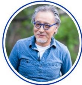
POINT PERSON & HOUSE COUNSELOR