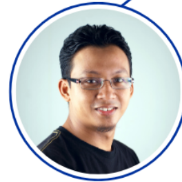
POINT PERSON & DAY STUDENT ADVISOR